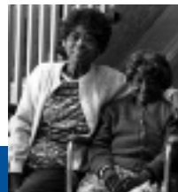
SOCIAL SERVICES BLOCK GRANT

States, local governments, and community and faith-based organizations use SSBG funds to provide a broad range of supports, from child protective services to home-based care for the ailing and elderly. This program has been cut over the last decade over $1 billion a year. United Way will continue to advocate for the restoration of SSBG funding.