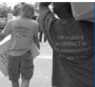
CRISIS PREPAREDNESS, RESPONSE AND RECOVERY